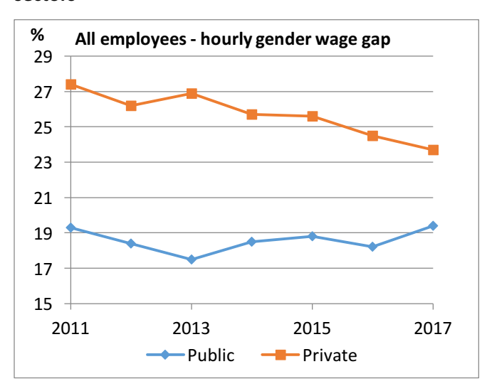
Figure 2 Gender wage gap in public and private sectors