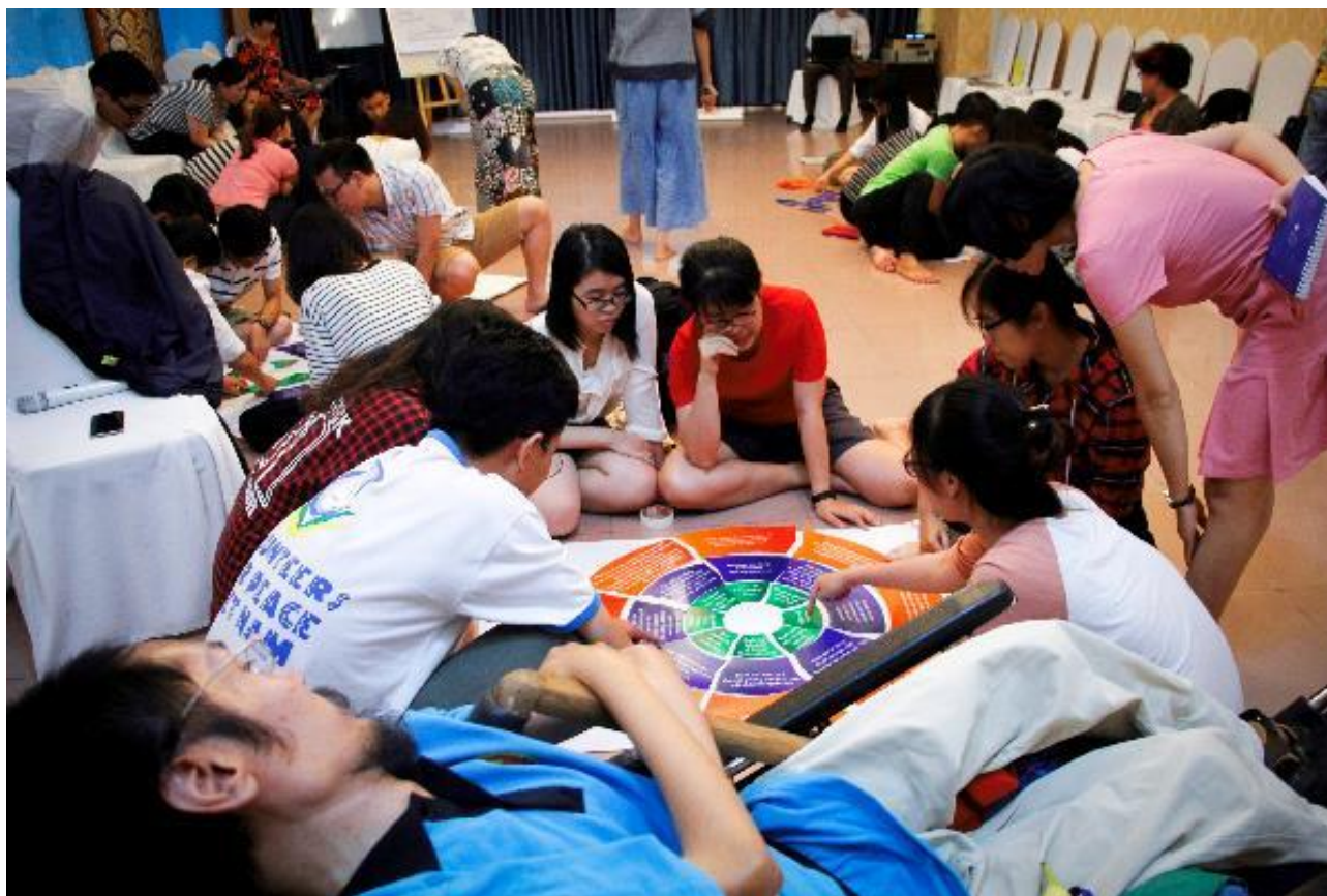
GRB training in Vietnam for youth and representatives of disadvantaged groups, including ethnic minorities and people with disabilities

5) Use the nationally adapted cycle as the basis for discussing key gaps, opportunities for further action and for mapping plans going forward.