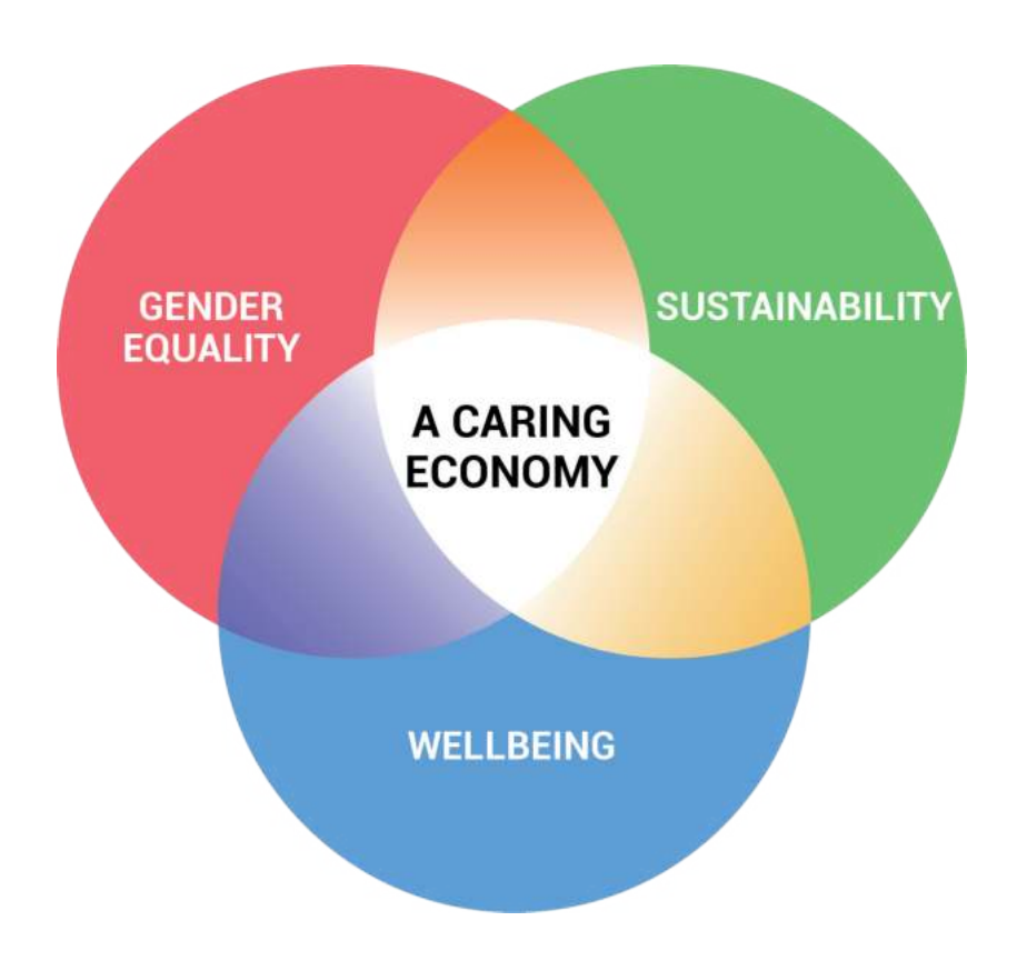
Figure 1: A caring economy encompasses gender equality, wellbeing and sustainability

months – of adequate financial support for those asked to quarantine, the low pay and poor conditions for so many key workers, many of whom are from migrant and BAME communities, and the ways in which mothers have been expected to make up most of the shortfall in childcare, with detrimental impacts on their own wellbeing.