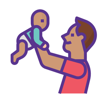
5. Transform the tax systems across the UK