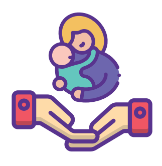
6. Refocus fiscal & monetary policy on building a caring economy