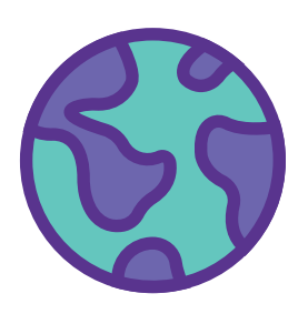
8. Work to transform the international economic system