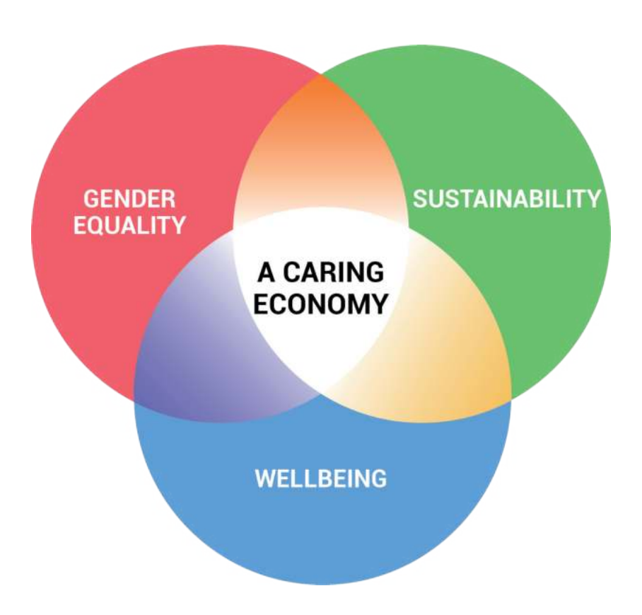
Figure 2: A caring economy encompasses gender equality, wellbeing and sustainability