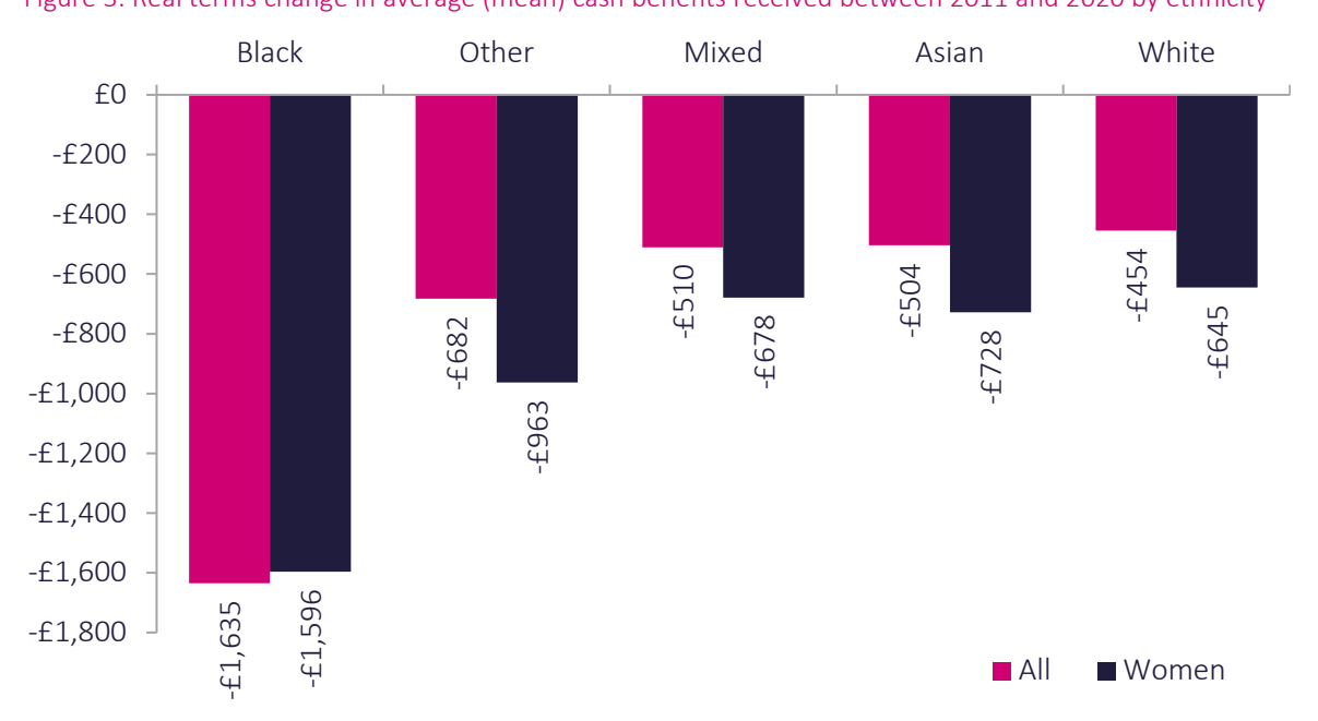
Figure 3: Real terms change in average (mean) cash benefits received between 2011 and 2020 by ethnicity 18

Between 2010 and 2020, successive governments implemented over 50 cuts to social security benefits affecting families. <sup>15</sup> Analysis by the Women's Budget Group and The Runneymede Trust <sup>16</sup> shows that the impact of austerity on Black and minority ethnic families has been severe. On average, white families now receive £454 less a year in cash benefits than they did a decade ago. But this rises to £806 less a year for Black and minority ethnic families and to £1,635 for Black families specifically. Black and minority ethnic women have been some of the worst affected and currently receive £1,040 less a year in cash benefits. <sup>17</sup>